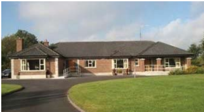
The New ABI Ireland House in Lisrath, Co. Louth

ABI Case Management: The ABI Case Manager is a professional who serves as a point of contact for an individual with an Acquired Brain Injury and their family. The Case Manager will seek out and coordinate appropriate local resources, monitor progress, as well as communicate with and support the individual, family, and other professionals as appropriate.