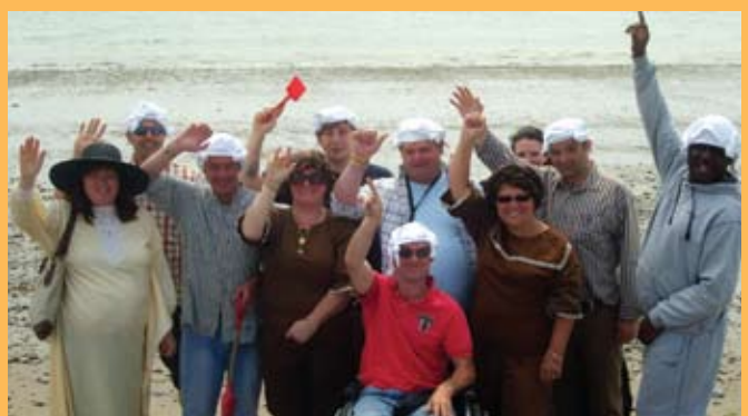
The members of the Headway Cork Art Group at Garryvoe

Earlier this summer, service users from the Headway Cork Art group traveled back in time to Garryvoe Beach in the 1930s for a jolly seaside portrait as part of their calendar project - sunshine optional as always!