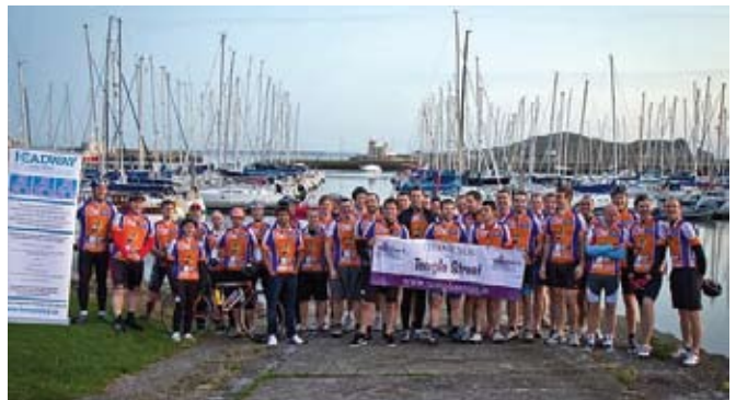
The Start of the Equinox Cycle Ride from Howth to Galway