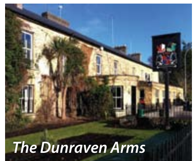
The Dunraven Arms